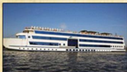
3 Day Nile Cruise to Nubia

Price includes taxes and fuel surcharges.