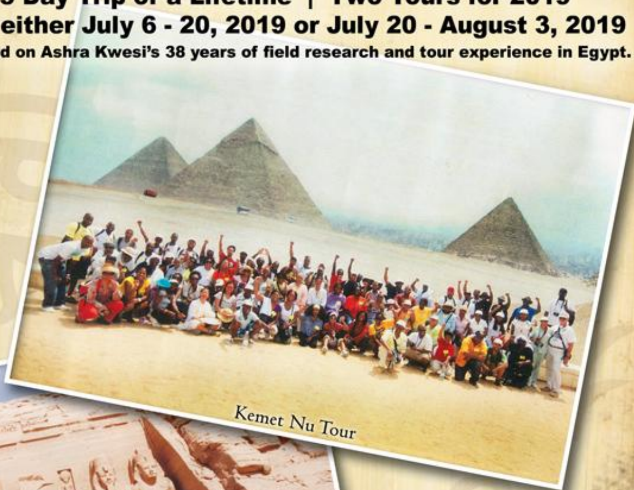
Kemet Nu Tour

A 15 Day Trip of a Lifetime | Two Tours for 2019 Join us either July 6 - 20, 2019 or July 20 - August 3, 2019 Tour is based on Ashra Kwesi's 38 years of field research and tour experience in Egypt.