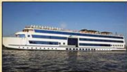
3 Day Nile Cruise to Nubia

Price includes taxes and fuel surcharges.