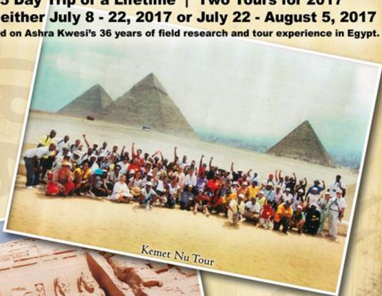
Kemet Nu Tour

A 15 Day Trip of a Lifetime | Two Tours for 2017 Join us either July 8 - 22, 2017 or July 22 - August 5, 2017 Tour is based on Ashra Kwesi's 36 years of field research and tour experience in Egypt.