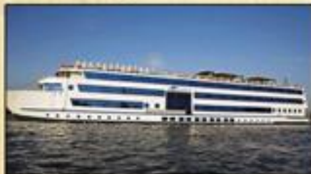
3 Day Nile Cruise to Nubia

Price includes taxes and fuel surcharges.